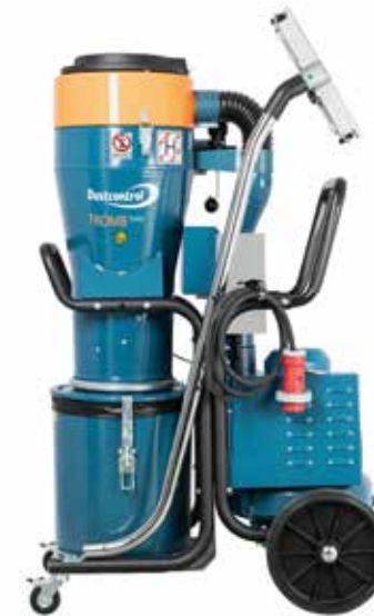
DC Tromb Turbo EX for ATEX zone 22