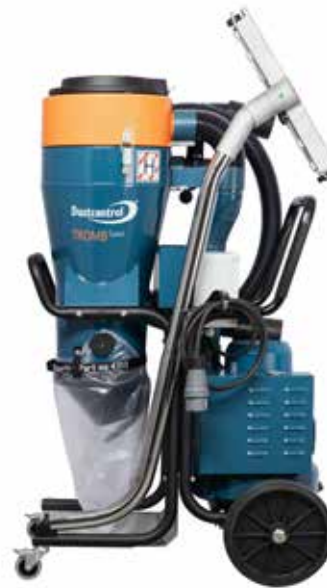
DC Tromb Turbo with Direct start