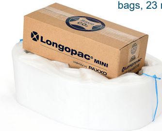
432177 Longopac plastic bags , 23 m /75 ft. Set of 4.