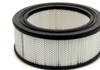
44016-1 HEPA H 13 filter made of cellulose and fibreglass