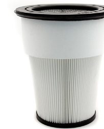
44017-2 Fine filter made of polyester